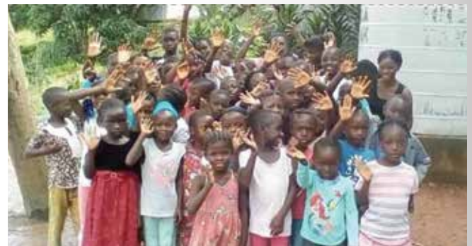
Children from Sierra Leone thank their sponsors for their continued support.