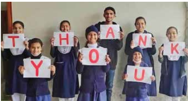
Children in Pakistan thank their sponsors for their continued support.