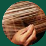
TRADITION We honor traditional values such as family values, unity and excellence.