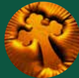
ONE PURPOSE We work to share God's love through world mission.