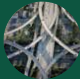
ACCESS We provide easy access for you to network with us.