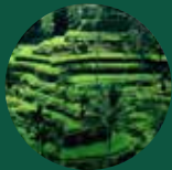
ORIGIN We were born in Indonesia. Green is the color of our land.